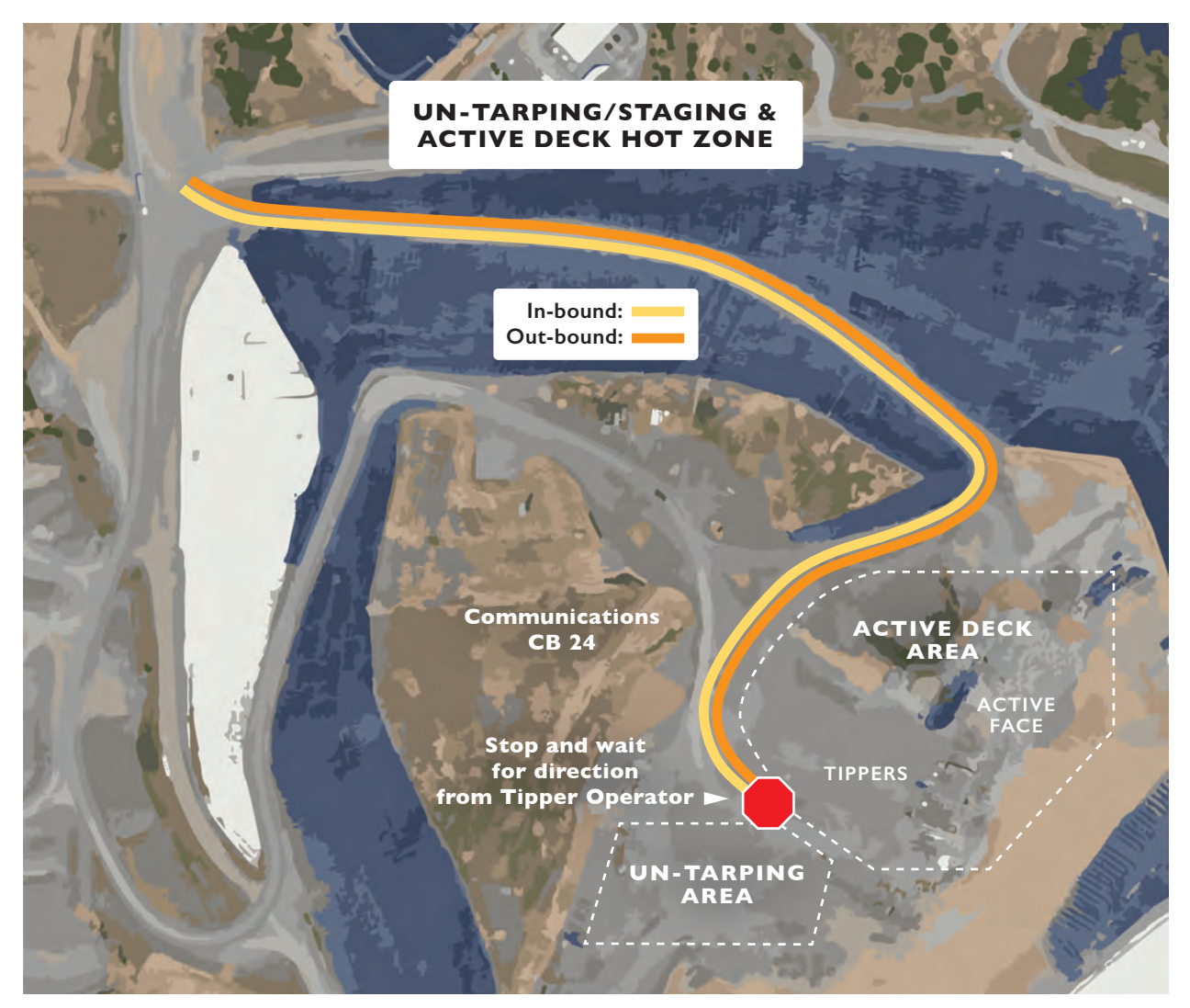
Figure 3. Un-Tarping/Staging and Active Deck Areas

The active deck consists of the areas where trucks are staged to unload/dump their materials. The active deck is continually modified and adjusted to meet operational needs (fill patters, special waste jobs, GCCS construction, etc.). A typical site plan and traffic pattern is shown below in Figure 3.