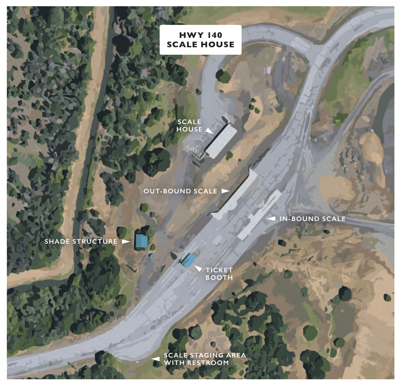
Figure 1. HWY 140 Scale House

Dry Creek Landfill and the Rogue Compost production area are commercial facilities and are not open to the public. The primary scales are located off HWY 140, on a private road, and is used by Knife River, Dry Creek Landfill, and Rogue Compost. Drivers should not exit their vehicles until retrieving their paperwork from inside the ticket booth after weighing out. This area of the site plan and traffic pattern are shown below in Figure 1.