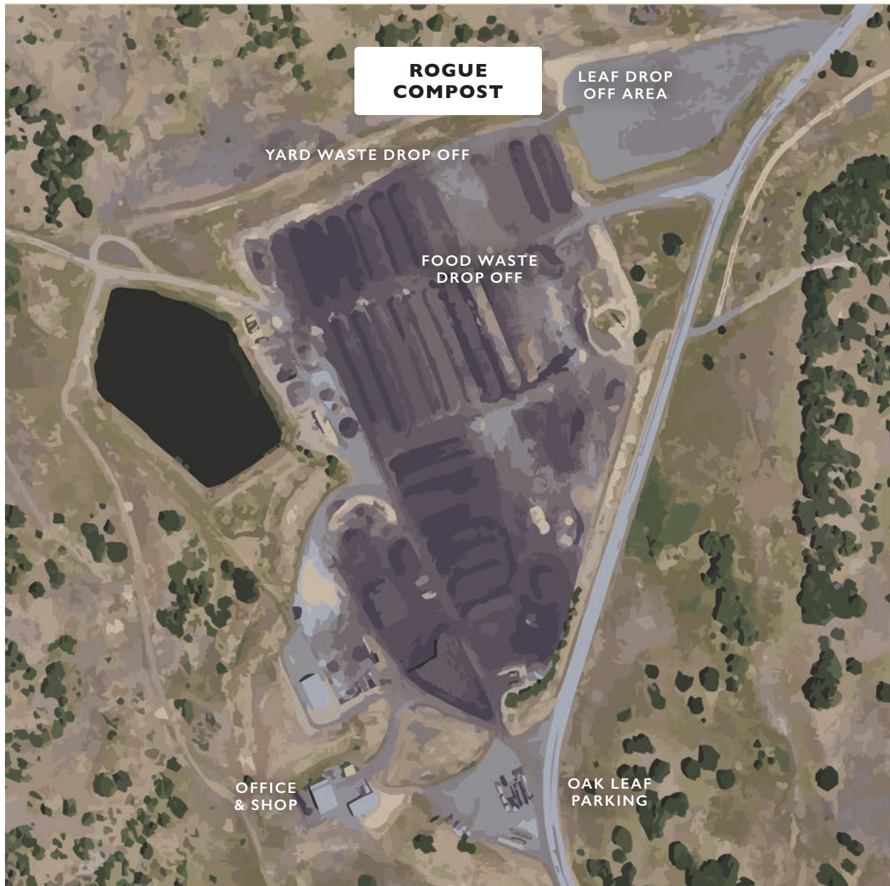
Figure 6. Site Plan Rogue Compost

Most of the traffic to and from the Rogue Compost production site is controlled by Oak Leaf Transport. In order to increase visibility for traffic entering and exiting the Rogue Compost site, the speed limit is reduced to 20 mph directly before the compost facility.