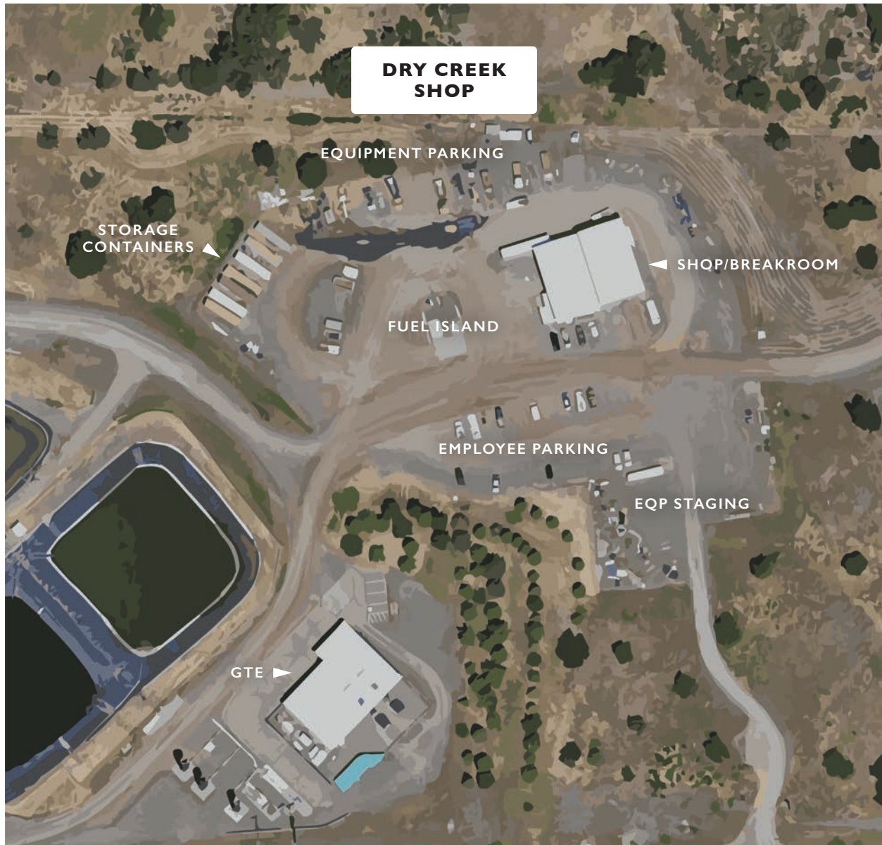
Figure 5. Site Plan Dry Creek Shop

The combination of foot and vehicle traffic around the shop site can potentially cause traffic congestion. Awareness of surroundings is important for continued safety. This area is shown below in Figure 5.