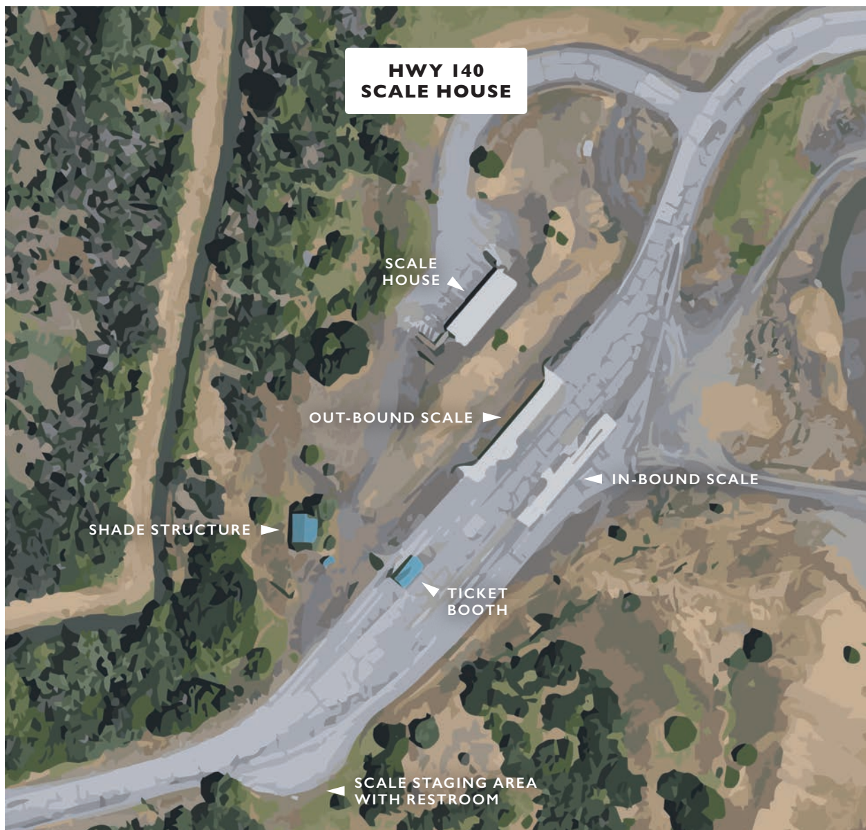
Figure I. HWY I40 Scale House

Dry Creek Landfill and the Rogue Compost production area are commercial facilities and are not open to the public. The primary scales are located off HWY I40, on a private road, and is used by Knife River, Dry Creek Landfill, and Rogue Compost. Drivers should not exit their vehicles until retrieving their paperwork from inside the ticket booth after weighing out. This area of the site plan and traffic pattern are shown below in Figure I.