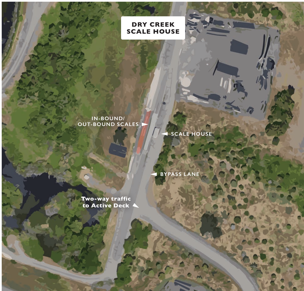
Figure 2. Dry Creek Scale House

Back-up scales are located off Dry Creek Road at the secondary entrance to the landfill. Aggregate trucks are not allowed to use this access point, as use is limited to Dry Creek and Rogue Compost commercial customers only (unless otherwise directed). This area of the site plan and traffic pattern are shown below in Figure 2.